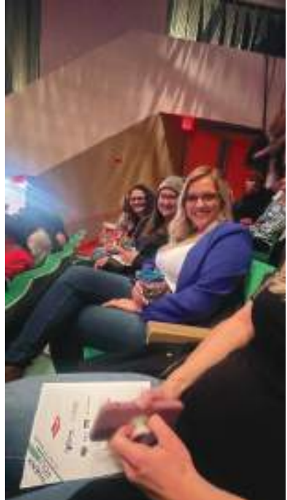
Photos of our WLAM GLBR members attending Legally Blonde - The Musical