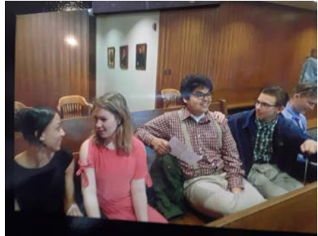
Nouvel Catholic Central High School Prosecution team; Nouvel witnesses

Have an enjoyable summer spending time with family and friends. Be well and safe travels to those that travel throughout the summer months.