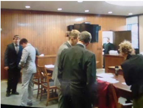
Birch Run High School Defense Counselors